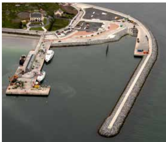
Cill Ronain Harbour Redevelopment