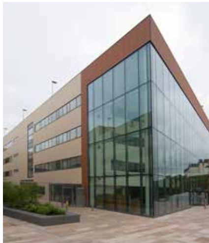
Revenue House, Blackpool