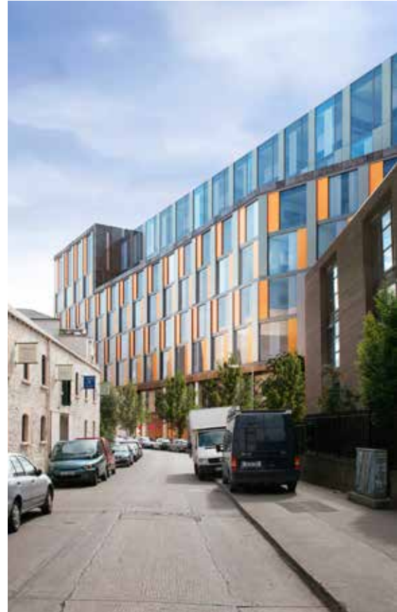
Mill Street Hotel