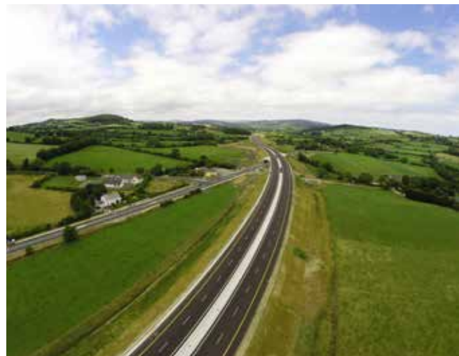
N11 Arklow Rathnew PPP