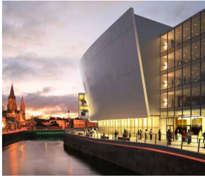
Cork Event Centre