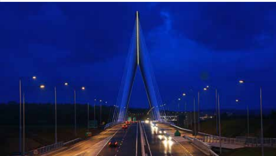
River Suir Bridge