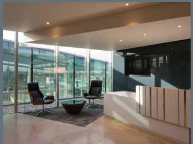
One Albert Quay