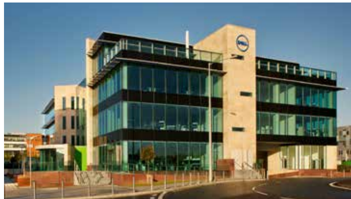
Dell HQ City Gate Mahon Point