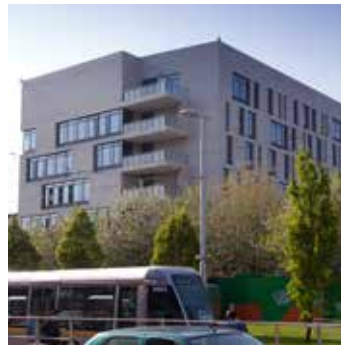
Mercer Institute St James's Hospital