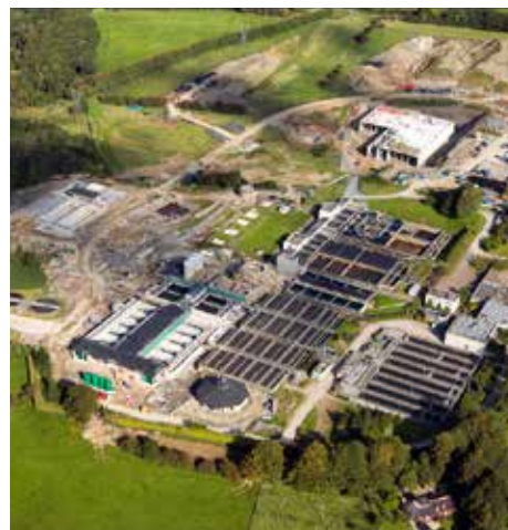
Ballymore Water Treatment Plant Redevelopment