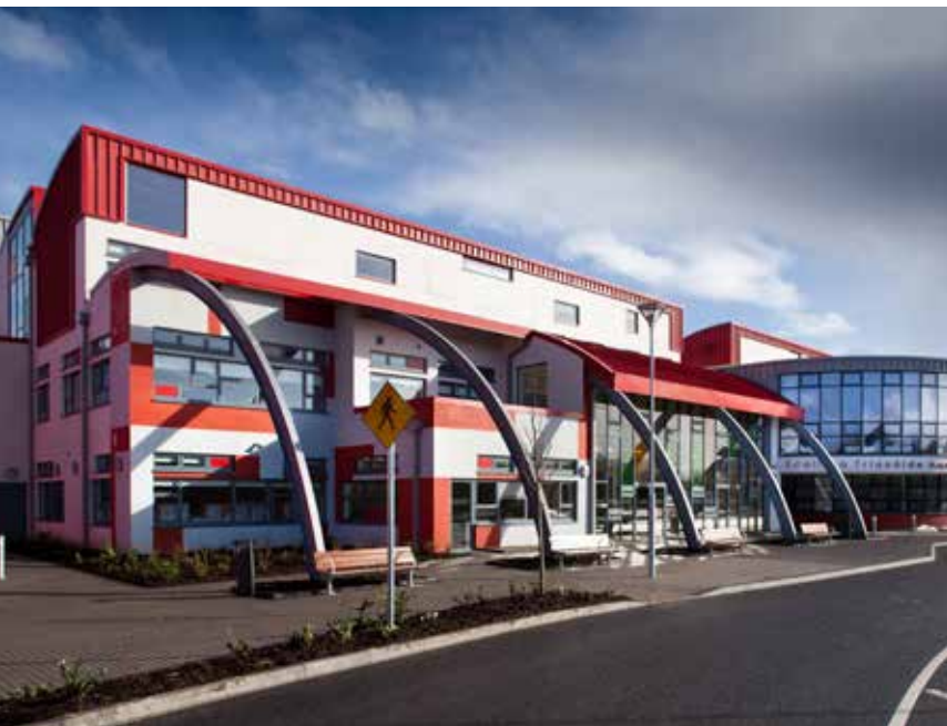
Schools Bundle 3 PPP