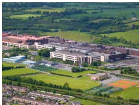
Microchip Manufacturing Facility, Leixlip