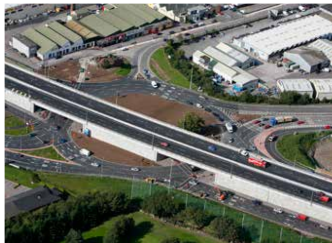
N25 Kinsale Road Interchange