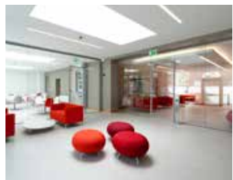
Communications Workers Union HQ