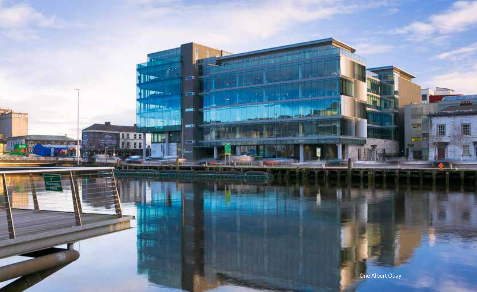
One Albert Quay