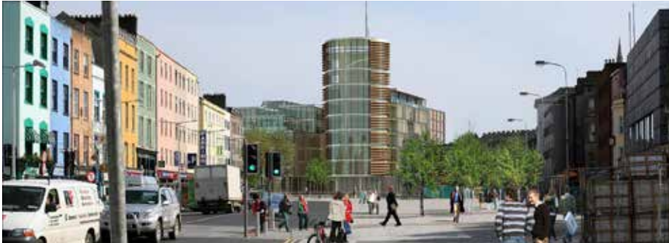
The Quay, Sullivans Quay