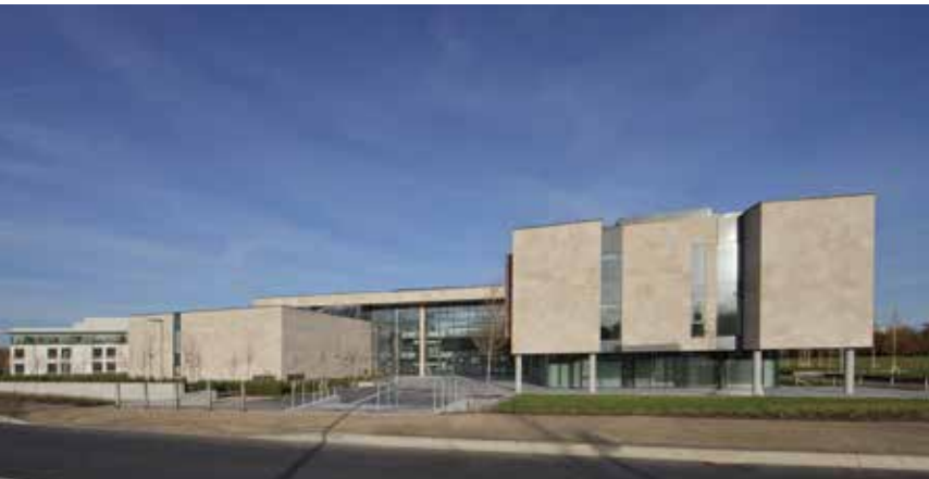
UCD Sutherland School of Law