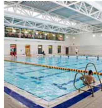
Tallaght Leisure Centre