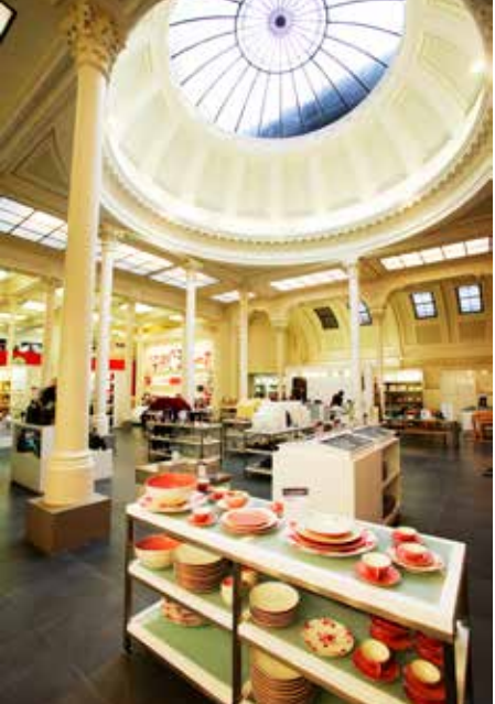
Engineering Building, NUI, Galway