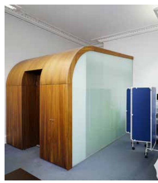
National Maternity Hospital, Consultancy Suites