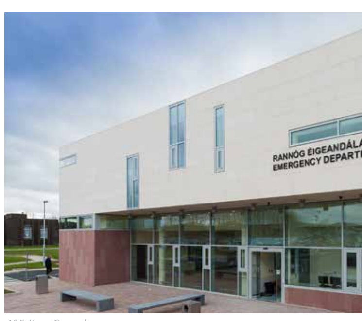
A&E, Kerry General

Interflow, established in 1974 form part of the BAM group, design and manufacture closed clean wall systems and associated equipment for laminar flow operating theatres, sterile and isolated areas and clean rooms. Total Installation Solutions in new build and existing hospitals is fast-track, clean construction and includes the integration of the specialist medical equipment.