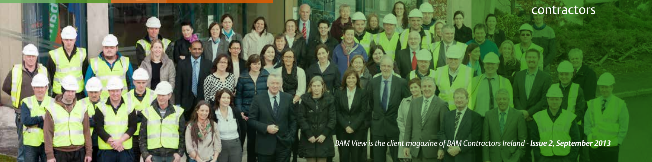
BAM View is the client magazine of BAM Contractors Ireland - Issue 2, September 2013