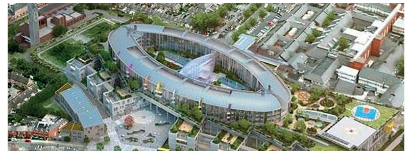
CGI of aerial view of New Children's Hospital

The 12-acre site on the St James's Hospital campus has been fully cleared and is now ready for the laying of foundations of what will be one of the biggest buildings in Ireland. The new hospital will include over 6,150 rooms, 4 acres of outdoor gardens and external space and 380 individual inpatient rooms each having their own ensuite for parents to sleep near their sick child.