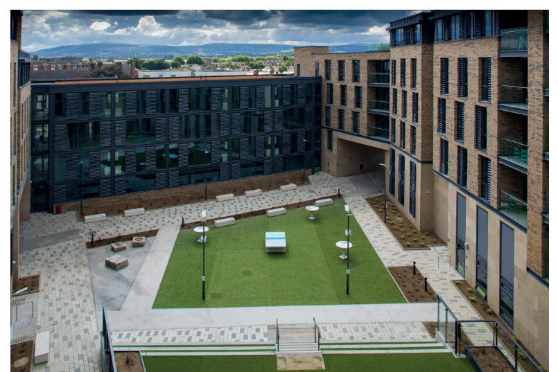
Uninest New Mill

positions becoming available upon completion. Once open in 2018, the residence will offer a combination of en-suite cluster apartments and community spaces, including an incubation hub for local start-ups, small businesses and entrepreneurs.