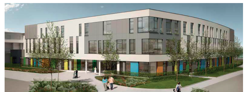
CGI of Paediatric Outpatient and Urgent Care Centre at Connolly Hospital

In addition, BAM have also been awarded the National Children's Hospital Satellite Centres at Tallaght and Blanchardstown.