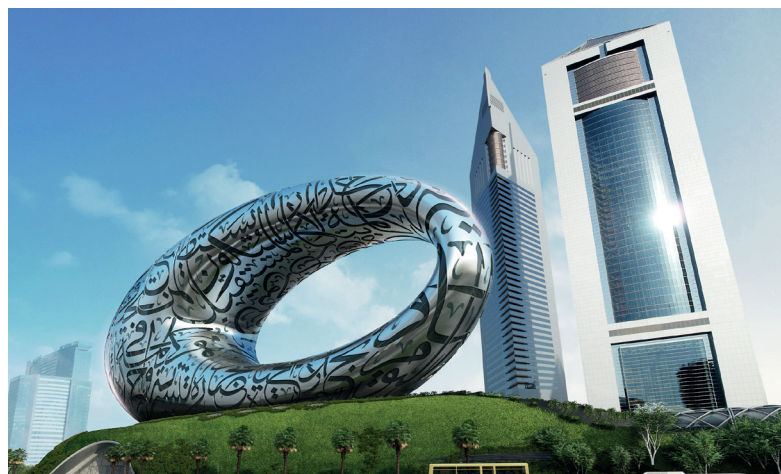
CGI of Museum of the Future, Dubai