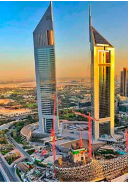
Aerial view of progress on the Museum of the Future

The MOTF site team are now on their eighteenth month on site. We spoke to some of our Irish colleagues about working on this complex project.