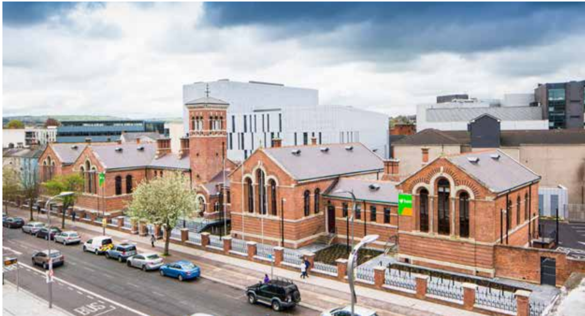
New Cork Courthouse on Anglesea Street

The new Cork Courthouse was officially opened in May by Minister for Justice and Equality Mr Charlie Flanagan TD following a €35 million redevelopment project by BAM.