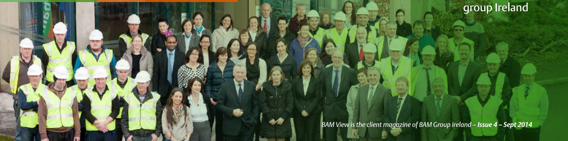
BAM View is the client magazine of BAM Group Ireland – Issue 4 – Sept 2014