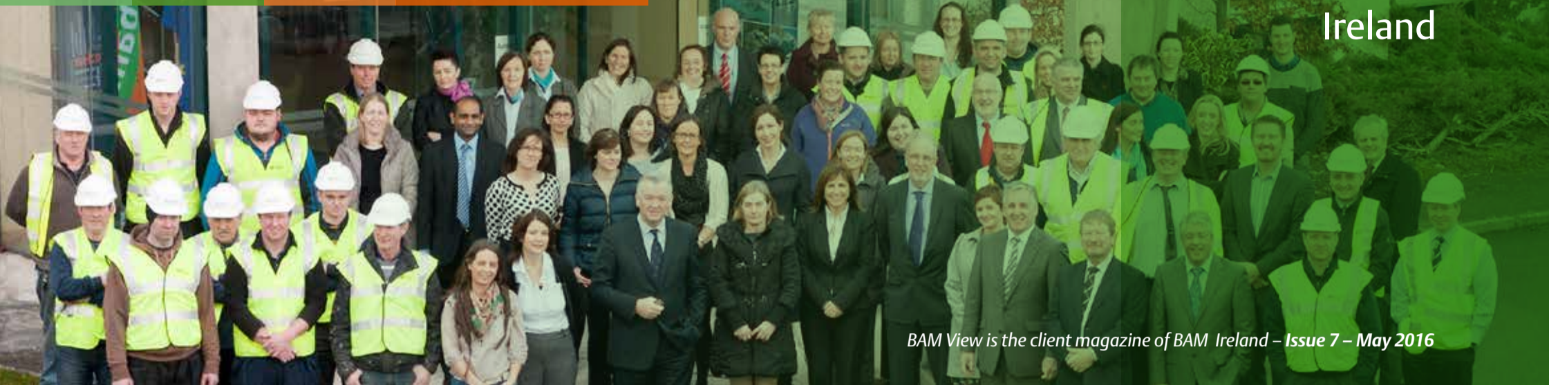
BAM View is the client magazine of BAM Ireland – Issue 7 – May 2016