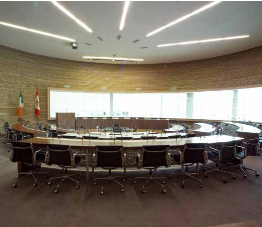
Cork County Hall Chamber

“The project was carried out in a smooth, efficient and professional manner. I would have no hesitation in recommending BAM Building to any entity because of the quality of craftsmanship, attention to detail and extremely professional staff”