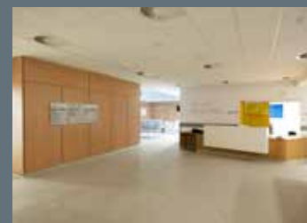
NPRO Reception, St. James' Hospital