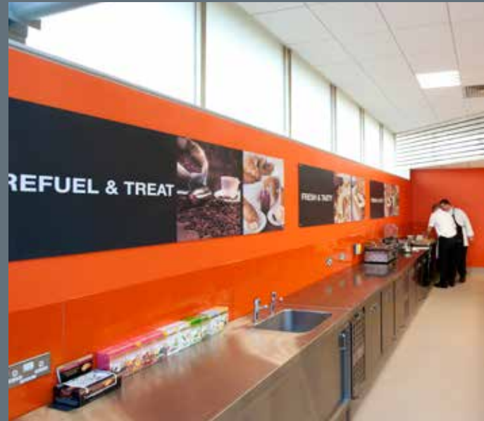
Bank of Ireland Restaurant

Hi-Tech / Industrial Hotel / Tourism Laboratory Leisure Medical / Healthcare Office Pharmaceutical Residential Retail & Commercial