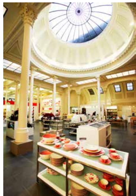
Habitat, Suffolk Street