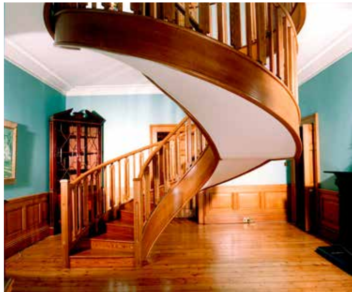
Communications Workers Union Farmleigh House