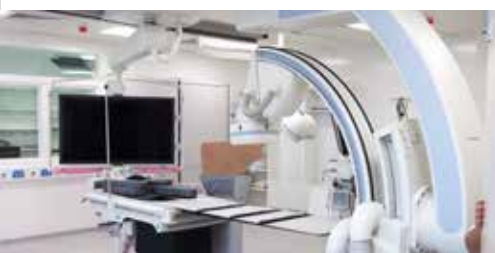
Cardiac Catheterisation Unit, Mater Private Hospital