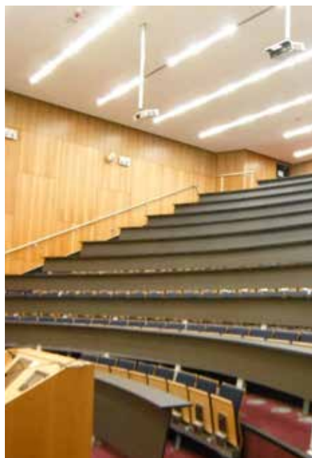
Engineering Building, NUI, Galway