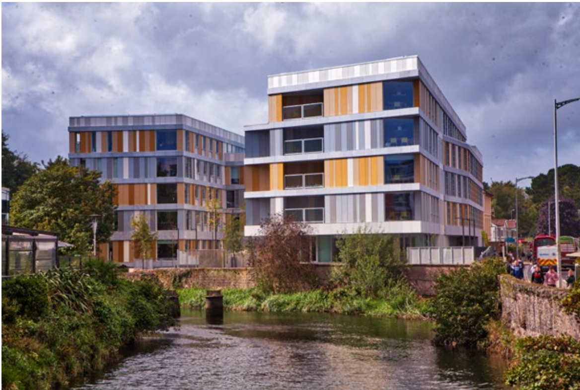
Amnis House Student Accommodation, Cork