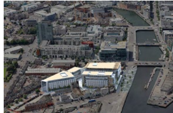
Navigation Square Aerial (CGI)