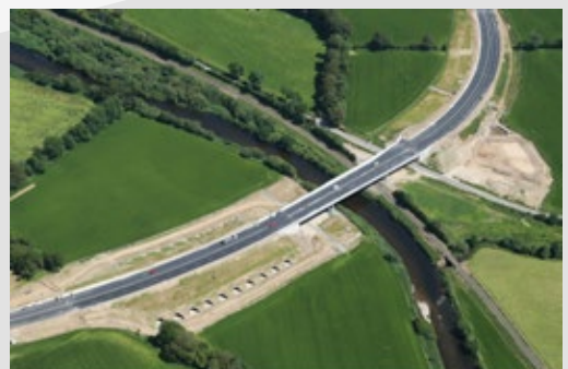
M11 Gorey to Enniscorthy PPP