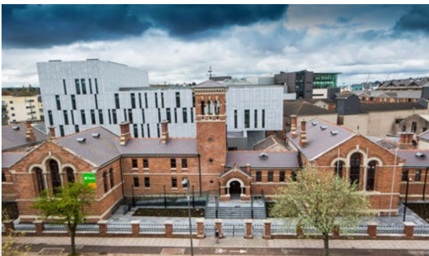
Cork Courthouse, Courts Bundle PPP