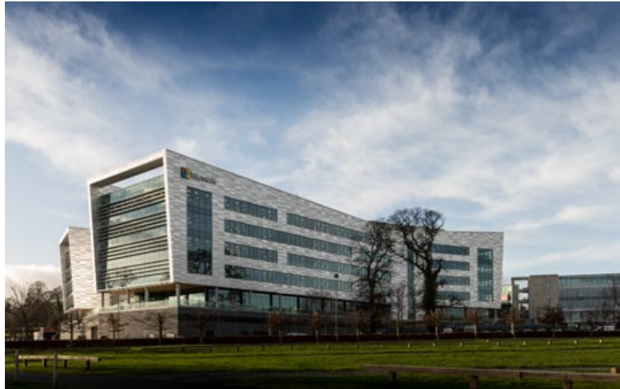
One Microsoft Place