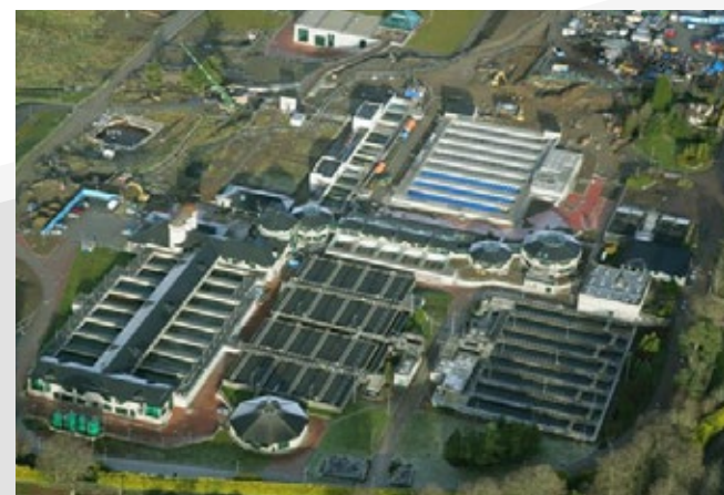
Ballymore Water Treatment Plant