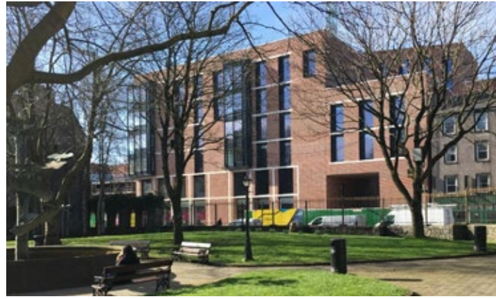
Brewery Quarter, Student Accommodation

Horgan's Quay Development Navigation Square Block A Navigation Square Block B Aloft Hotel, Mill Street Dublin Brewery Quarter, Student Accommodation