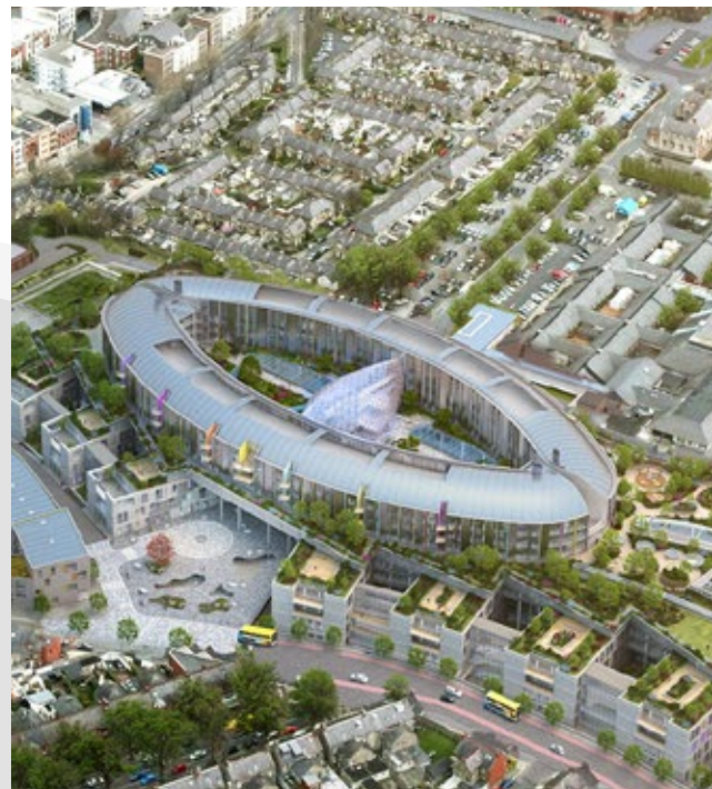
New Children's Hospital, St. James's, Dublin (CGI)