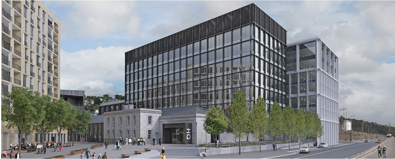
Horgan's Quay Development (CGI)