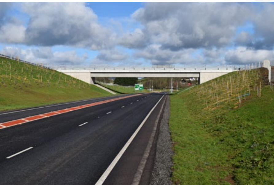
A31 Magherafelt Bypass