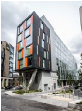
Aloft Hotel, Mill Street Dublin