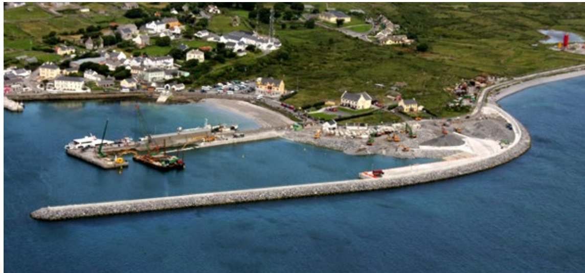
Cill Rónáin Harbour Redevelopment, Inis Mór, Co. Galway