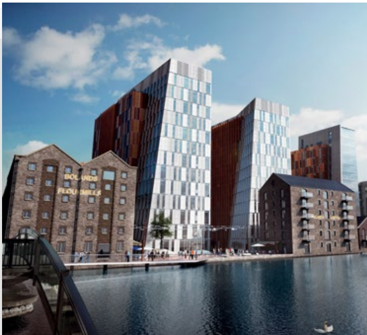
Boland's Quay, Dublin (CGI)