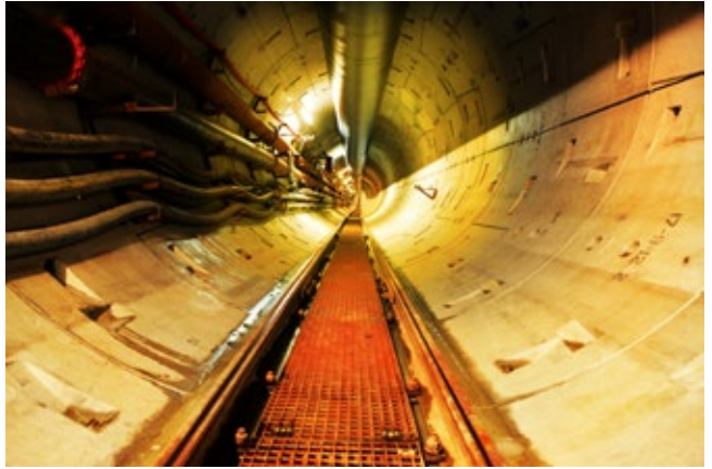
Shell Corrib Gas Pipeline Tunnel