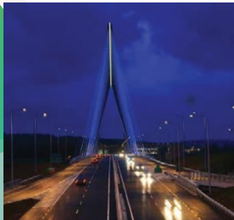
River Suir Bridge, N25 Waterford Bypass PPP