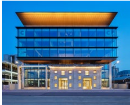
Navigation Square Block A