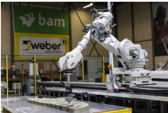
3D printer in action

At BAM we are leaders in the construction industry digital revolution. We embrace this digitalisation, we 'build it before we build it' by utilising initiatives such as 3D printing, augmented reality, BIM and collecting data via smart algorithms. BAM was the first organisation in the country to achieve the international industry standard PAS 1192-2 verification for the use of BIM process for delivering construction projects.