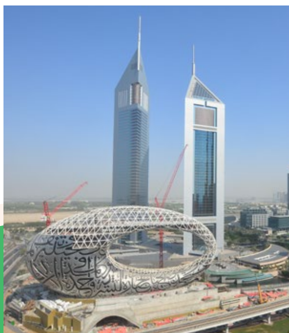
Museum of the Future, Dubai, UAE