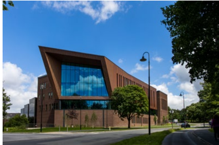
Glucksman Library, University of Limerick