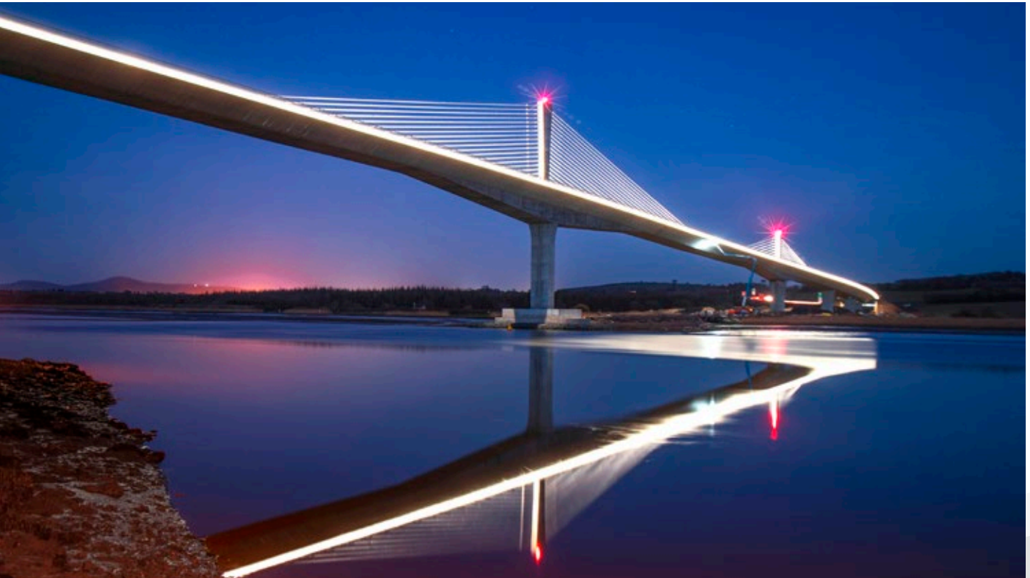
Rose Kennedy Fitzgerald Bridge – New Ross Bypass PPP