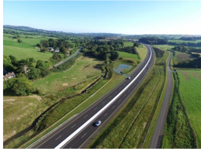
N11 Arklow Rathnew PPP