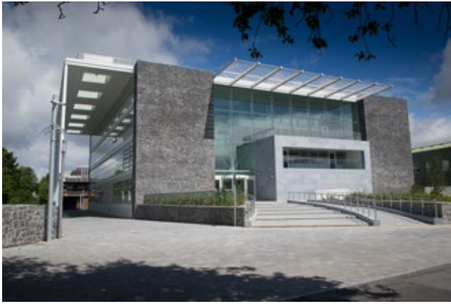
Human Biology Building NUI Galway